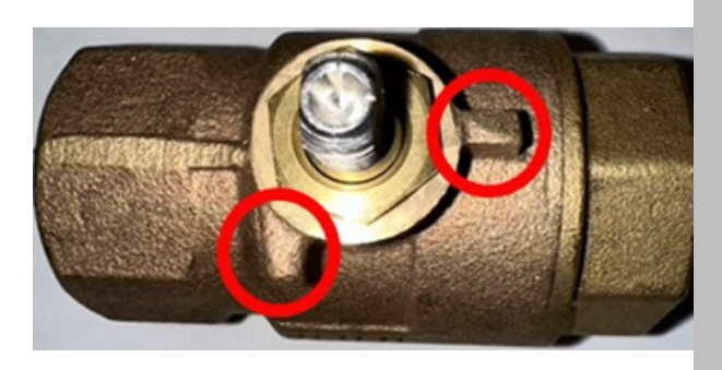
Adjustable Memory Stop on ball valve lever

A Travel Stop is used to ensure that the valve operates from a full open to a full closed position (0 and 90 degrees) but no further. The stop itself can be as simple as the stop