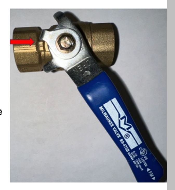
Adjustable Memory Stop on ball valve lever

A Memory Stop provides position adjustment when the valve is going to be operated at some position other than full open, such as in a throttling application. This stop can be adjusted throughout the full range of valve travel, but typically is set somewhere beyond 45 degrees open. The valve will still be able to close fully. The term Memory Stop comes from the fact