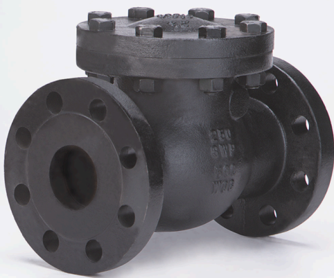
F-2970 Iron Check Valve

So, what happens if a check valve is the wrong size?