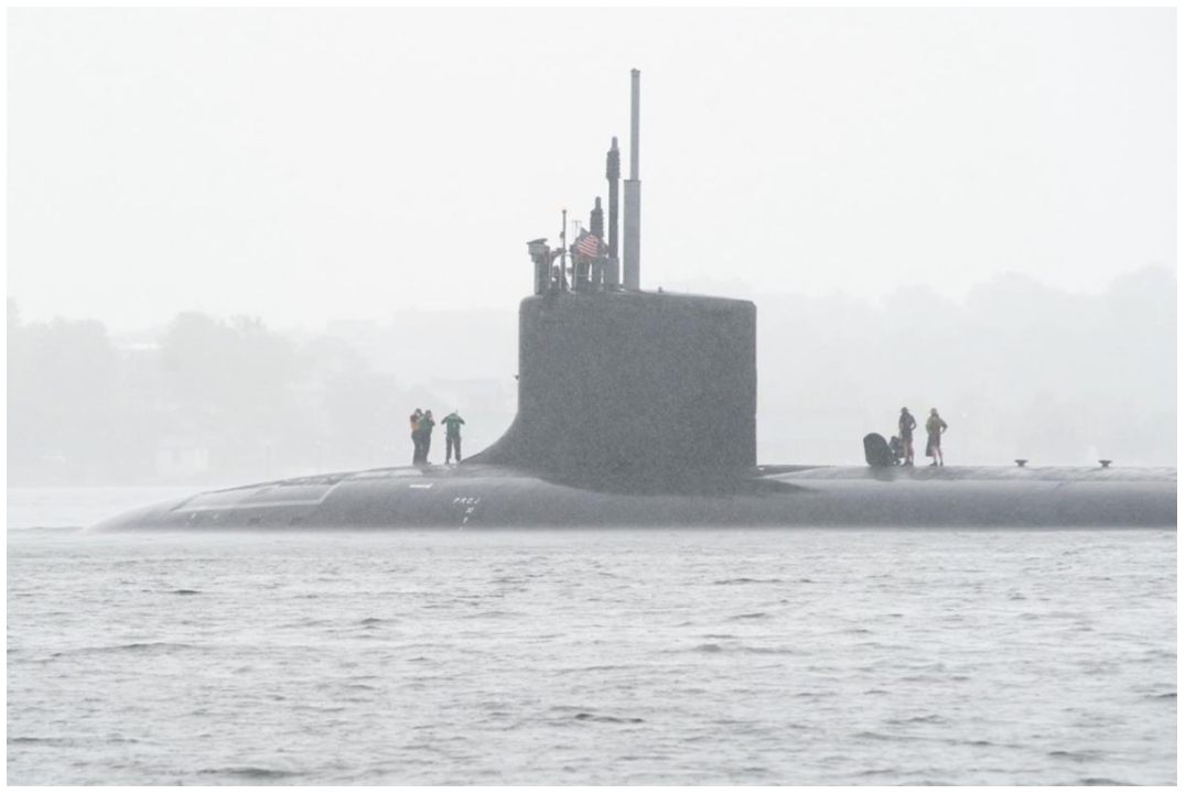
The Virginia-class attack submarine USS Oregon (SSN 793)

Each year, we join our partners in the Submarine Industrial Base Council (SIBC) in recognizing National Submarine Day. Along with more than 5,000 U.S. companies providing critical materials to the U.S. submarine programs, members range from the smallest specialty shops to manufacturers of main propulsion equipment.