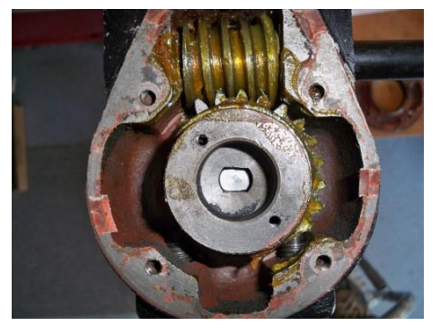
FIGURE 13 FIGURE 14 (CLOSED) FIGURE 15 (OPEN)

If required, the gear operator's cover can be removed by first removing the indicator plate & unscrewing the operator cover cap screws. Care must be used in prying off cover plate (FIGURE 13) to not damage the internal gear mechanisms (FIGURES 14 & 15).