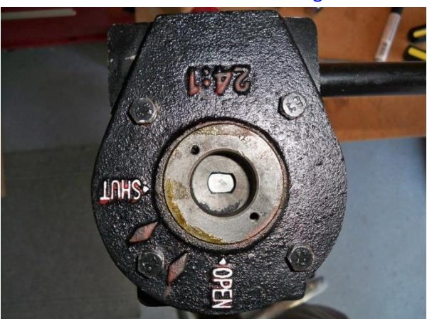
FIGURE 12 (Position indicator cover removed showing valve in CLOSED position)