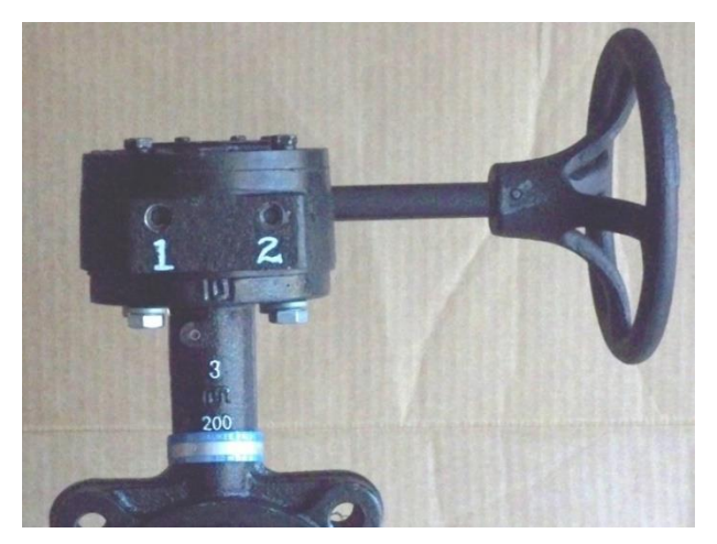
FIGURE 4 Proper orientation of gear operator.