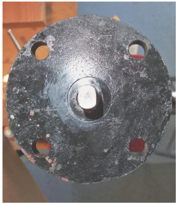
FIGURE 3 Top of BFV stem showing stem's "double D"