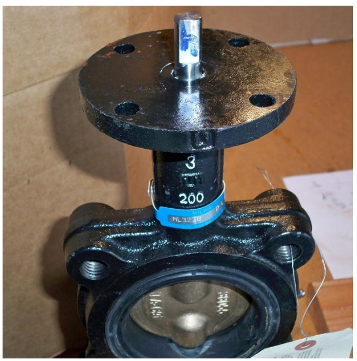
FIGURE 1 Orientation of BFV — Valve SIZE & PRESSURE ratings are facing you