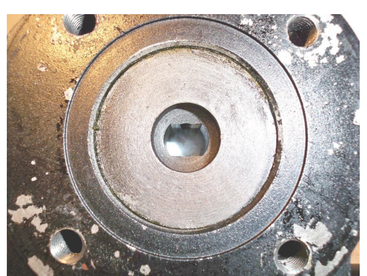
FIGURE 2 Bottom of gear operator & drive bushing Note "double D" pattern.