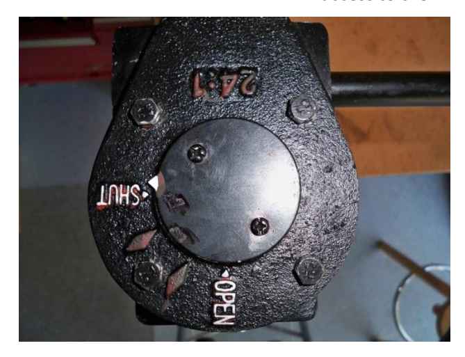
FIGURE 10 (Position indicator cover on)

If valve is installed in line – removal of the gear operator's position indicator plate will allow visual access to the BFV's stem position.