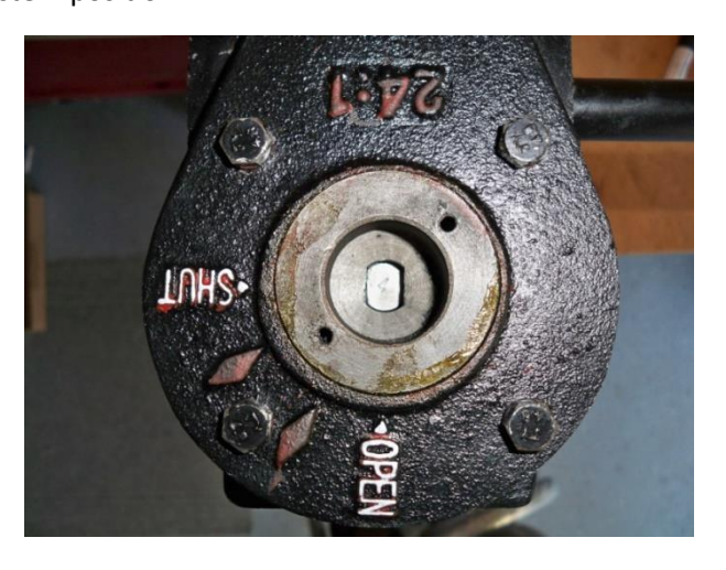
FIGURE 11 (Position indicator cover removed showing valve in OPEN position)